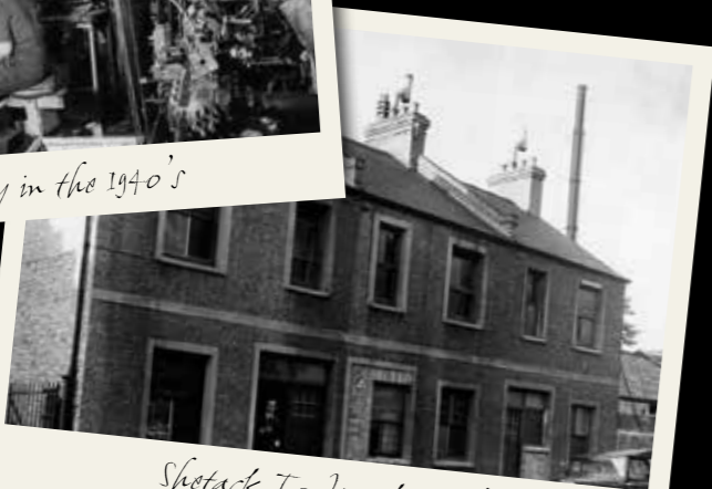
Shetack Toolworks 1930's