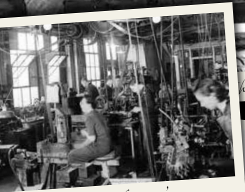
Factory in the 1940's